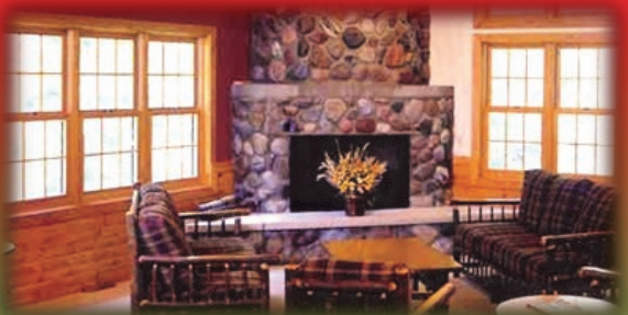
Lodging in beautiful Black Oak Lodge

Sandi Jarvis has led this special holiday weekend for 6 years. We provide the basic ingredients... and you bring only the special ingredients that we'll make YOUR cookies special! Join them for fun and holiday cheer!